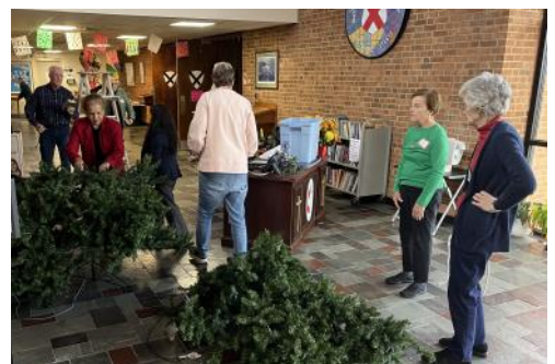
PHOTO HIGHLIGHTS FROM THE CHAPLAIN GRADUATION