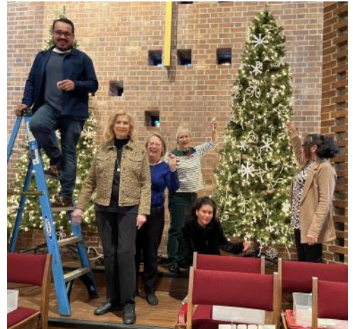
PHOTO HIGHLIGHTS FROM HANGING OF THE GREENS