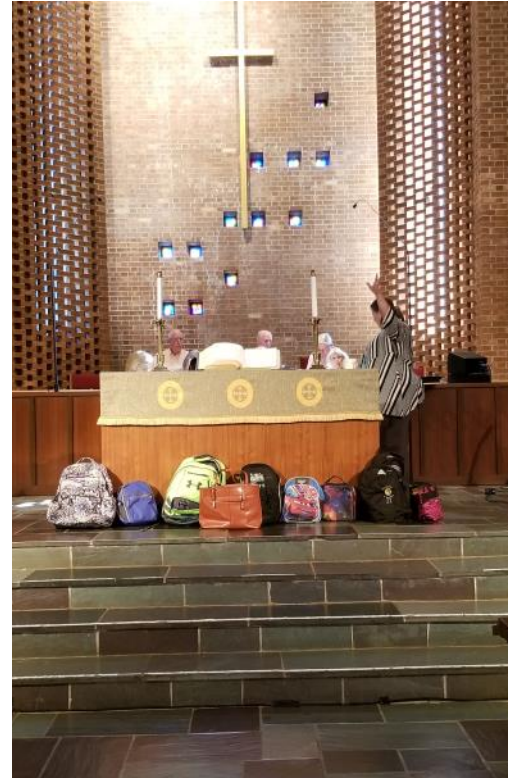
PHOTO HIGHLIGHTS FROM BLESSING OF THE BACK PACKS.