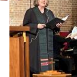
GOOD FRIDAY WORSHIP SERVICE