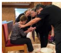
WASHING OF THE FEET