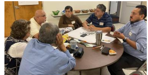
PHOTO HIGHLIGHTS FROM SATURDAY, AUGUST 12 TH TRANSFORMATION JOURNEY GATHERING.