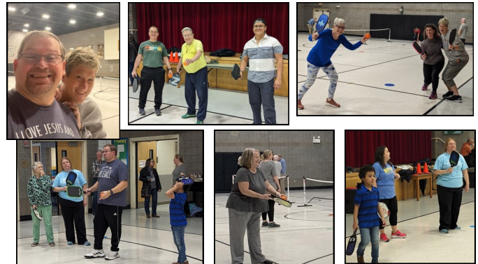
PHOTO HIGHLIGHTS FROM PICKLEBALL