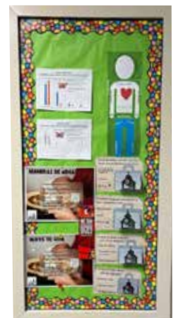
Financial Bulletin Board located in office hallway and Family Life Center.